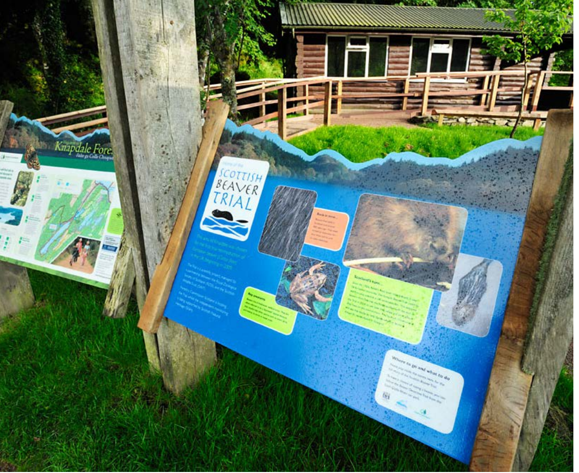
Scottish Beaver Trial

the Trial increasing visitor numbers to the area. The value of wildlife experiences at Knapdale itself, such as guided walks were calculated between £355,000 and £520,00 over the five-year trial period (Gaywood et al. 2015). In addition, huge numbers of adults and children engaged with the project throughout the 5-year trial through formal and