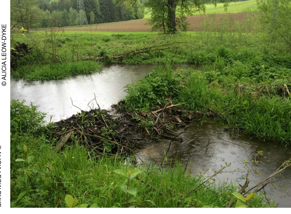
Beaver dams are permeable structures as they are made from mud and sticks. Water can also over top and flow around the edges of beaver dams.

Both the above hydrological impacts are likely to assume increased local significance as climate change creates increasingly erratic rainfall patterns, with wetter winters and drier summers.