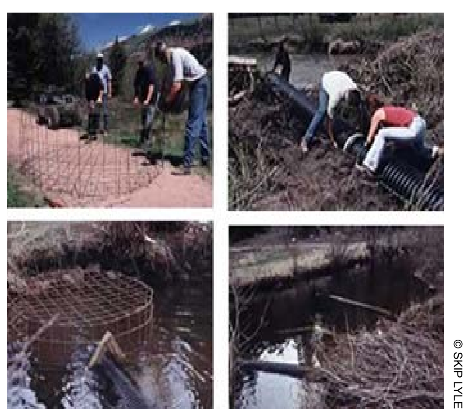
(Above) Inserting a flow regulator into a dam to control the pond water level.