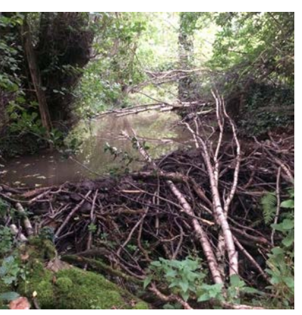
Beaver dams can come in different sizes and shapes, depending on the landscape